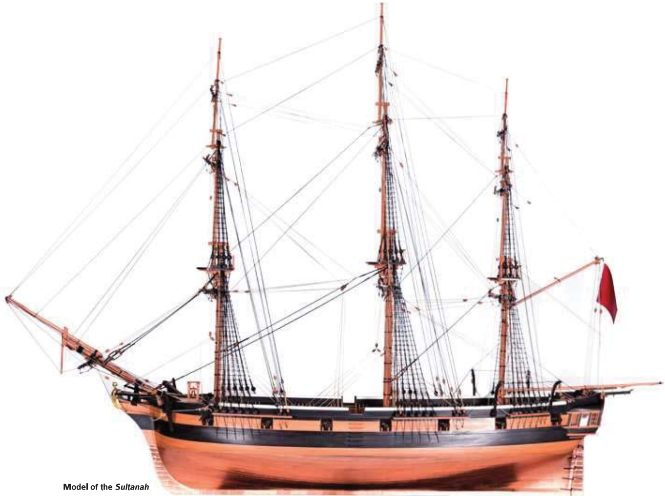
Model of the Sultanah